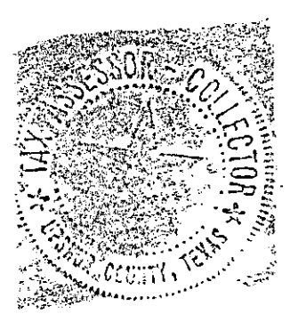
Tax Assessor-Collector Upshur County, Texas